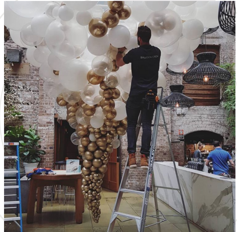
Air-filled, latex balloon decor

We can also provide flyers, posters and graphics to help you inform the public about the positive aspects of using latex balloons.